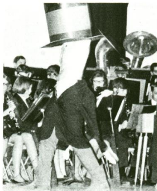
The hats go marching one by one ...