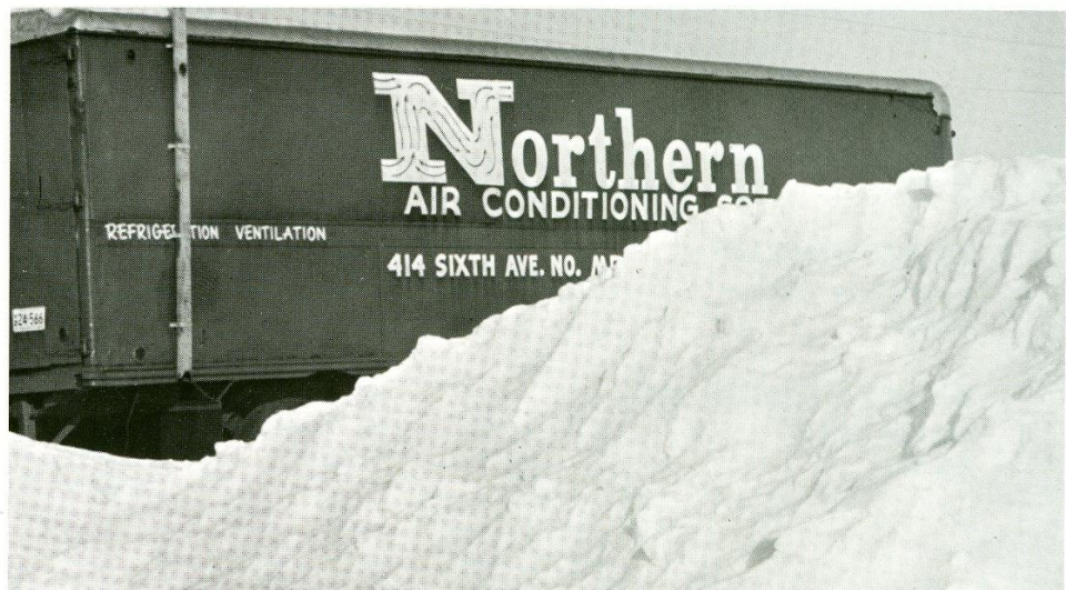
Wayzata hires only the most efficient of workers and equipment.